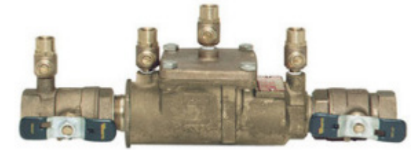
Typical DCVA installed at your meter (double-check valve backflow assembly)