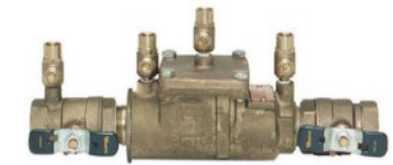
Typical DCVA installed at your meter (double-check valve backflow assembly)