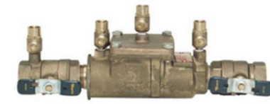
Typical DCVA installed at your meter (double-check valve backflow assembly)